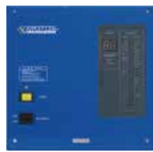
VM3712A Control Unit