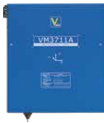
VM3711A Mechanical Unit