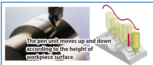
The pen unit moves up and down according to the height of workpiece surface.

VM3710A can mark characters on 100×100mm area, which is the largest in our lineup. Two or more strings can be marked in the large marking area of workpiece at a time.