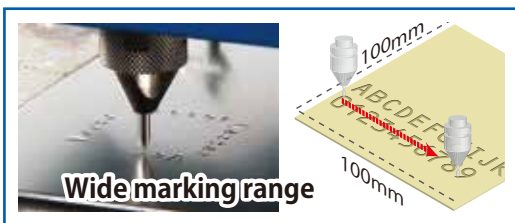
Wide marking range

VM3710A Air Pen Marking Machine delivers semi-permanent marking on a wide range of metals, including steel, stainless-steel and aluminum, as well as plastics and other nonmetallic metals. It is designed to handle marking needs for production management, quality assurance, product-liability countermeasures, ISO measures, distribution management and more.